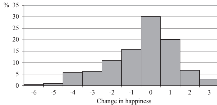
FIGURE 1. PERCENTAGE DISTRIBUTION OF CHANGE IN HAPPINESS

graduates are in full-time employment commensurate with qualification (FT1, 40.63%); in full-time employment not commensurate with qualification (FT2, 28.13%); self-employed and part-time employed (SPT, 6.25%).