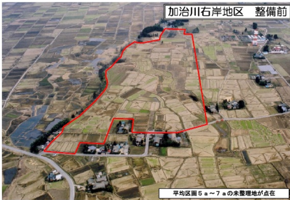
a) Before. Plots had irregular shapes, and their sizes averaged 0.05–0.07 ha each.