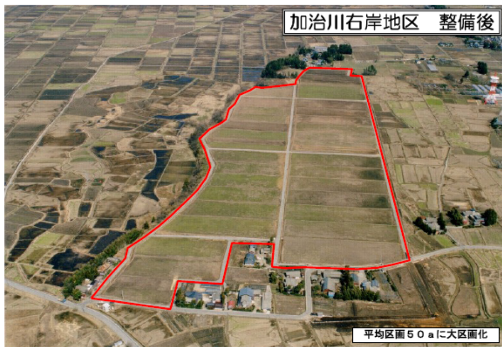
b) After. Plots were reshaped and enlarged to a mean plot size of 0.5 ha each.